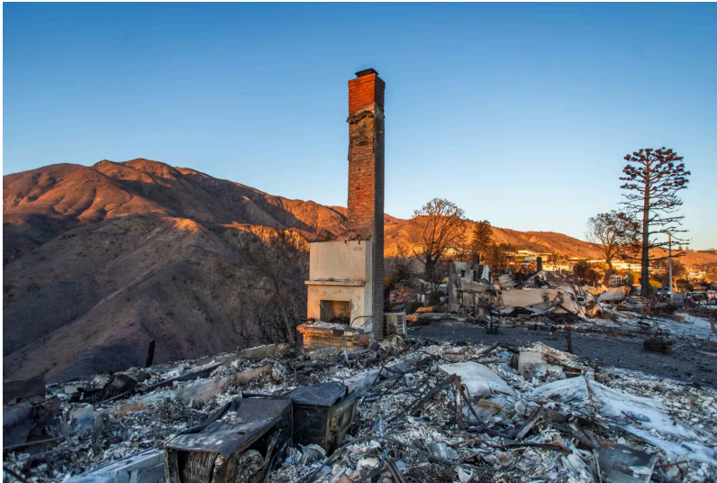
A house burned down by the Palisades fire in Los Angeles.

News Corp, owner of The Wall Street Journal, also operates Realtor.com under license from NAR.